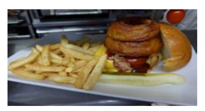
Lighthouse Tavern burger.

Replacing Firehouse Eatery March 1st is Lighthouse