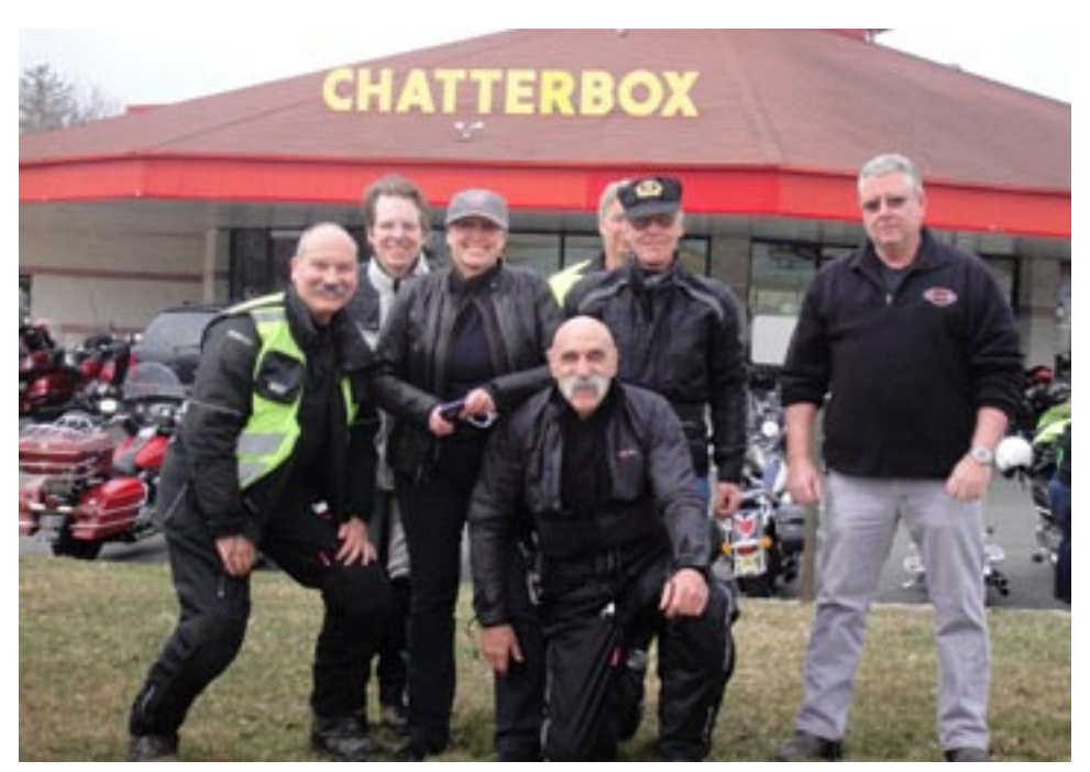
Goodbye Chatterbox, we'll miss you!

They have been very supportive of our group and offer a special discount for Polar Bears. So if you shop there, please make sure they know you are Polar Bear member.